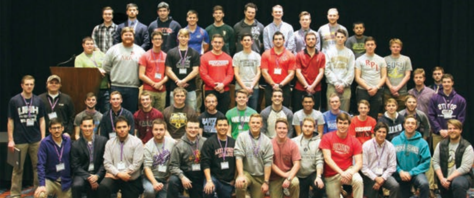
High Alpha Summit attendees

BROTHER BY BROTHER THEIR FUTURE. YOUR IMPACT.